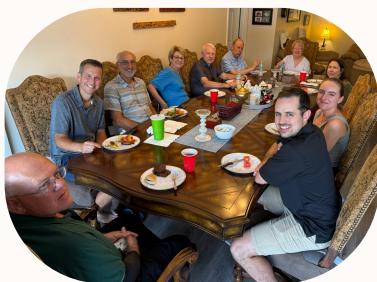
Small Groups - 200 invested members