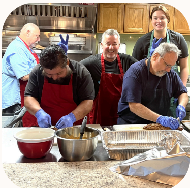
Meal Team - Fed over 1000 people this year