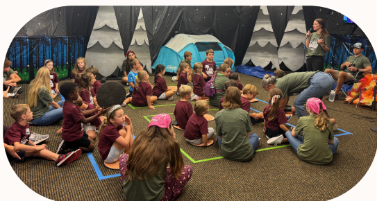
VBS - 200 kids and over 100 volunteers