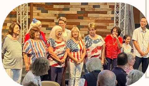
SALT - Average of 80 members weekly