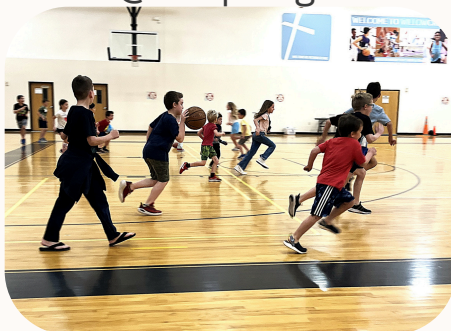
W@W Spring 2025