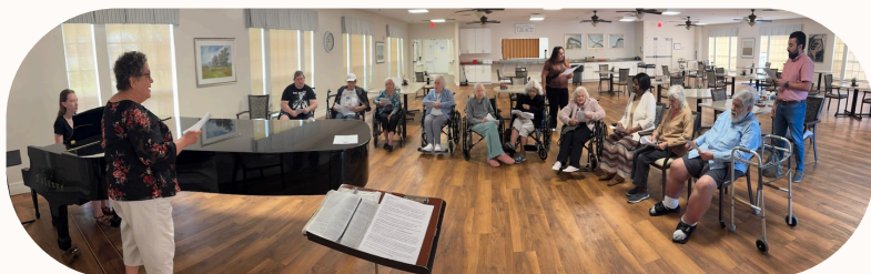
ALF Weekly Sunday Services